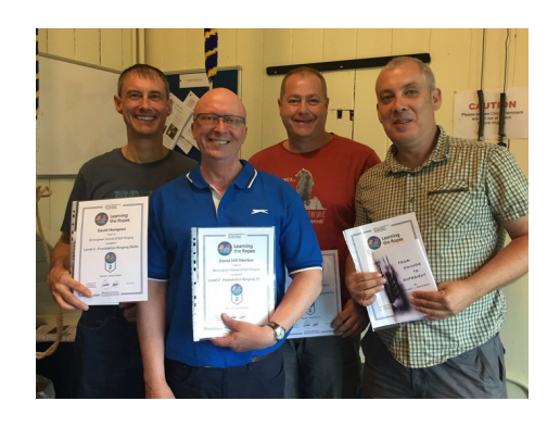
Four happy BSoBR ringers with their LtR Level 2 certificates.

We are lucky to be based in an area of high population density with lots of towers close together. We know it's very different in more isolated or rural areas, but what we have learnt will work for everyone in every area. Working together creates a great social network and improves local ringing.